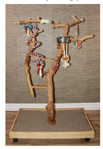
An exercise gym and a separate training stand are also recommended.

The day cage is perhaps the most important investment you can make. It should be a spacious, stimulating environment allowing for plenty of light and air. Ideally the space within the day cage should be at least 10 times the size of your bird with its wings opened or as large as you can accommodate within your living space.