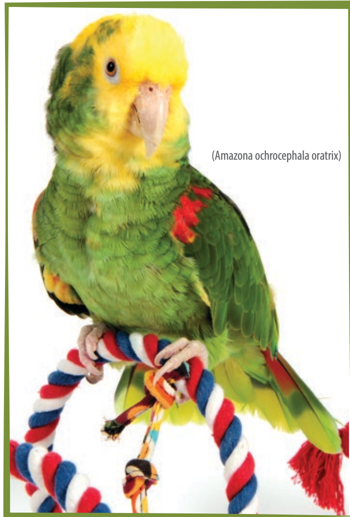
(Amazona ochrocephala oratrix)